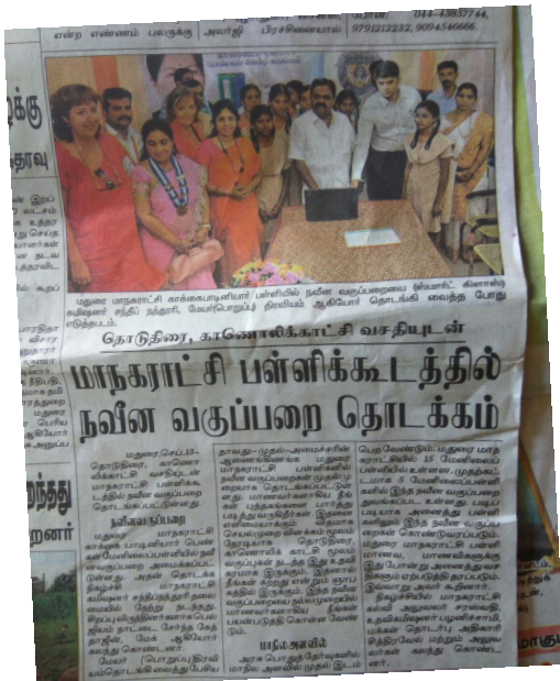
SMART CLASSROOM AT KAKAIPADINEYAAR GOVT. SCHOOL FOR GIRLS, MADURAI.

“The mind is not a vessel to be filled, but a fire to be kindled.”