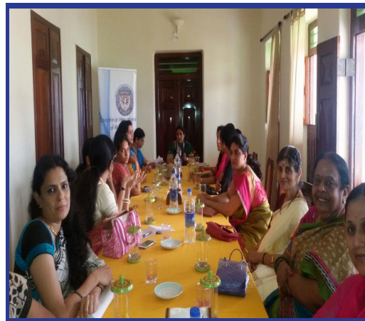
Meeting and Recreation was at 'The Bangala' Karaikudi.