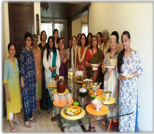
Fellowship meeting with SI Chennai downtown members